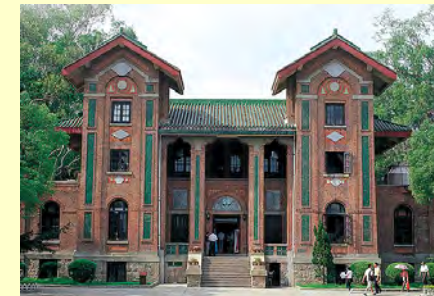
Huai-shi Hall in Sun Yat-sen University