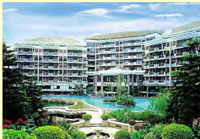
International Conference Hall, Yihe Hotel, Guangzhou